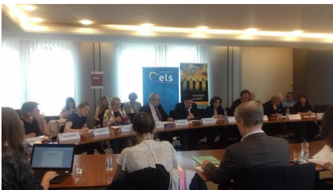
The GAMIAN meeting

The Mental health, patient empowerment and self-management of care and treatment – a Call to Action document was drafted through a participatory process involving stakeholders including experts through experience, advocates, families and carers, psychiatrists, human rights lawyers, service providers etc. Past discussions and debates regarding the use of the term “patient” in favor of “persons” were referenced; however, neither the arguments against nor the rationale for maintaining this emphasis was not elaborated on.