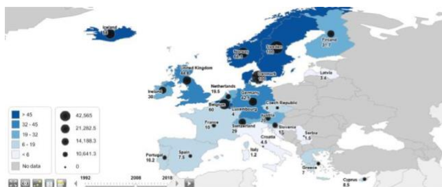
OT's per 100.000 head in 2008

When viewing the number on occupational therapists per COTEC Member Associations we can happily announce that most countries are very successful in developing the profession and COTEC is able since 2018 to represent the interests of 180.000 occupational therapists. But it seems that there is no time to rest. Europe's population increase was higher than expected and demand for occupational therapy service is growing due to demographic changes and it is crucial to keep that pace of increasing the total number of OT's across the European region. The following two figures are from the COTEC statistics website and are illustrating the amount of occupational therapists per 100.000 head in 2008 and 2018.