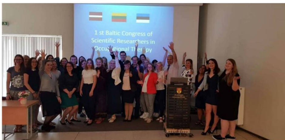
OT researchers from Lithuania, Latvia and Estonia

I focused my attention on this topic because it was a great pleasure to see the results of the last year's workshop for the Baltic countries, namely the organization and