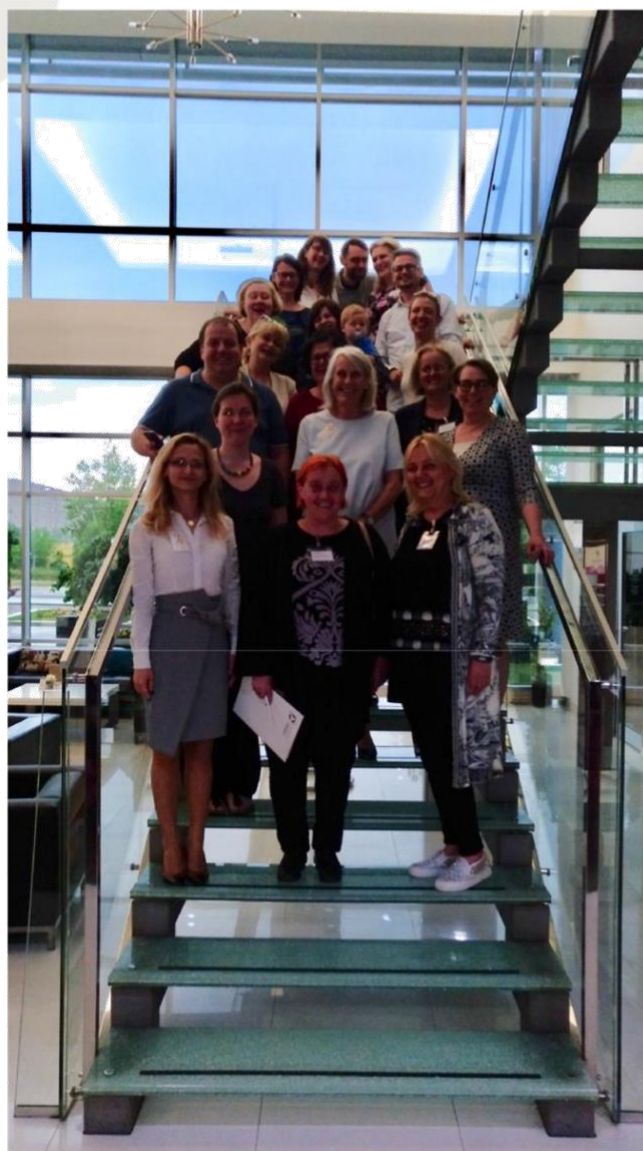
With the participants of the workshop

There was also time to meet old friends and make new ones over lunch and by the end of the day everyone left feeling tired, but hopefully inspired and refreshed in looking forward.