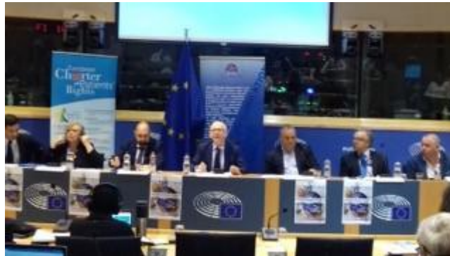
12 th European Patients Right Day conference