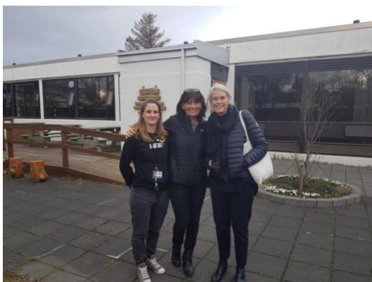
With OTs at BUGL