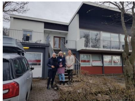
With OTs at the Mental Health Day centre

Please see the slides attached here to learn more about this successful team.