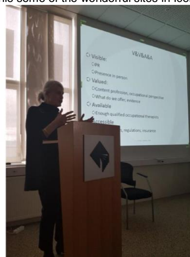
The speech of the COTEC President