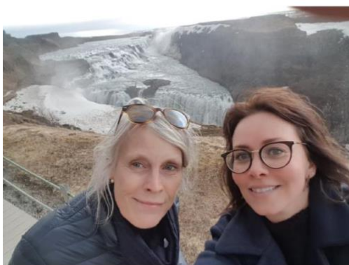
At the waterfall