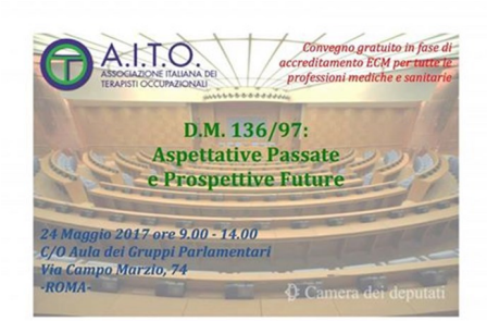
The invitation postcard for the 20<sup>th</sup> anniversary of the recognition by law of the OT profession entitled: "Past and Future perspectives"

AITO, Italy describes changes in the funding of technical aids in the public health system and the new register of health care professionals. Read more