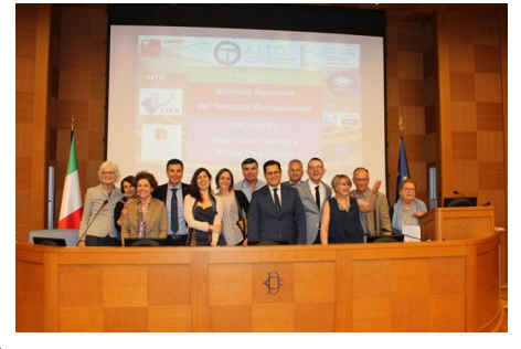
All the Speakers of the event

APETO, Spain announces developments of both the association and National Health system along with professional congresses in the country.