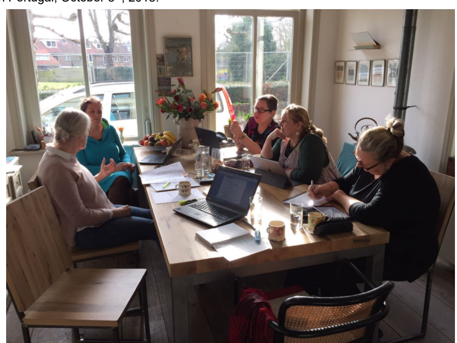
Occupational Therapy Europe Coordinating Group

The Theme of the second Joint Congress was discussed. The development of Occupational Therapy Europe will be continued. Occupational Therapy Europe Coordinating Group will meet face-to-face twice a year, alongside other meetings. The next meeting will be held in Portugal, October 8<sup>th</sup>, 2018.