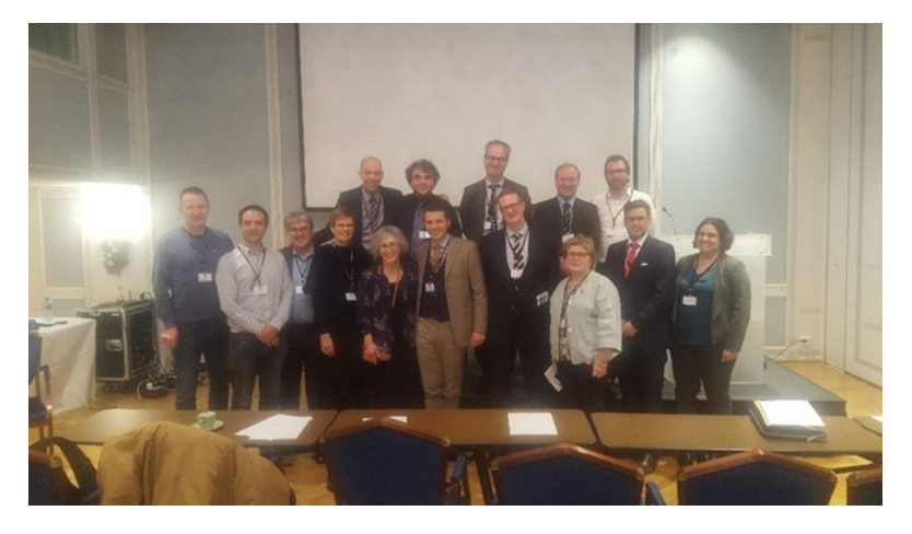
European Delirium Association Board in Oslo during the European Congress

Occupational therapists working in the geriatric setting (in community, nursing home and rehabilitation) in Italy and Switzerland