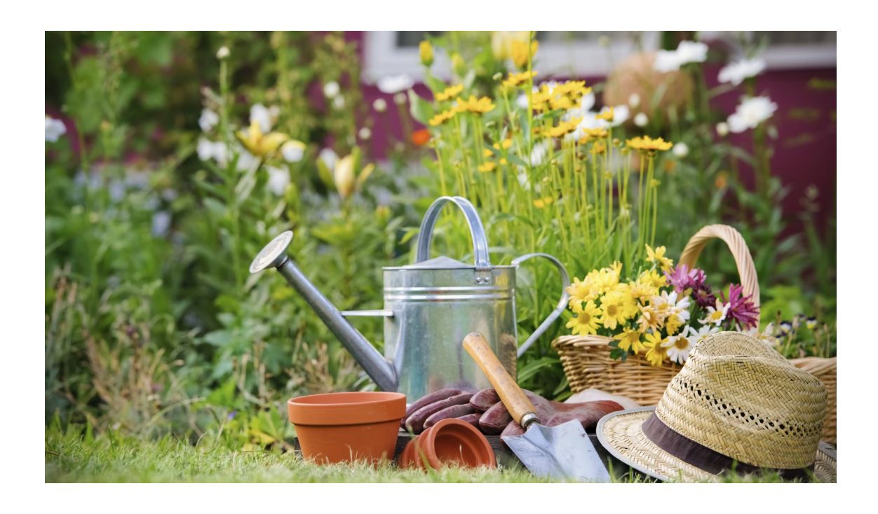
full of new ideas and inspiration!