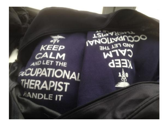
Preparation for the OT workshop

For more information or questions contact: <a href="mailto:postionpaperot@gmail.com">postionpaperot@gmail.com</a>