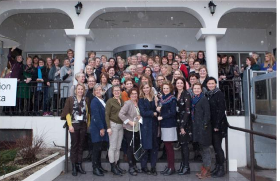
Members at the 40th Anniversary Conference