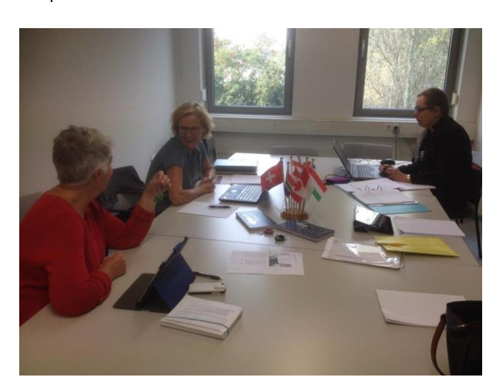
OT-EU coordinating group

On Saturday afternoon the OT-EU coordinating group came together again to divide tasks and set dates for meetings, which will probably be in May 2017 and in September 2017 in Vienna before the COTEC GA.