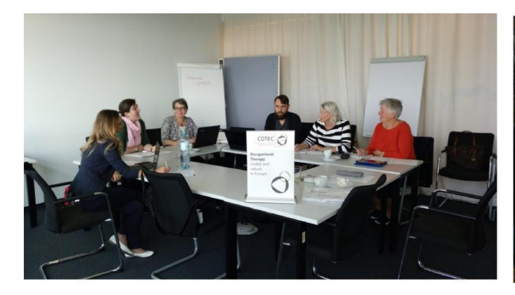
The COTEC Executive Committee at the 3rd Interim meeting 2017 in Vienna

The next COTEC Executive Committee face-to-face Interim meeting is planned for the end of January 2018. Skype meetings continue to be held monthly.