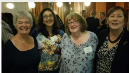
Organising Committee Members: (from left to right)

The Congress will also include eight workshops on issues of significance for the profession in Europe for example, how we can best use research, the importance of fieldwork placements for students, working with refugees, e health. If you're planning to be at Congress make sure you come along and have your say.