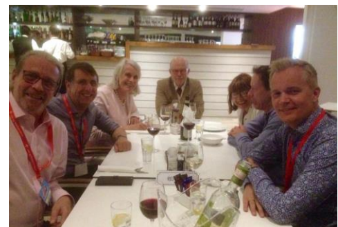
Informal dinner statement group:

Alliances: http://www.coteceurope.eu/resources/