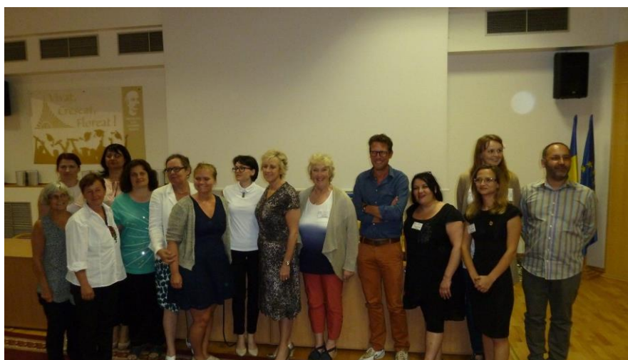
The international guests together with the organizing group

The presence of the occupational therapist within the multidisciplinary team was felt as a necessity in the process of reforming and deinstitutionalisation of the social services meant to protect the child and the disabled, at a national and local level, a process involving, among other things, family and socio-professional reintegration. In this context, the occupational therapist can through its activity facilitate the full participation of people in difficulty in the social life, creating equal opportunities for participation in society.