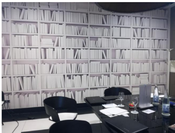
The venue is ready for the meeting