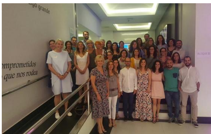
The participants in the Symposium