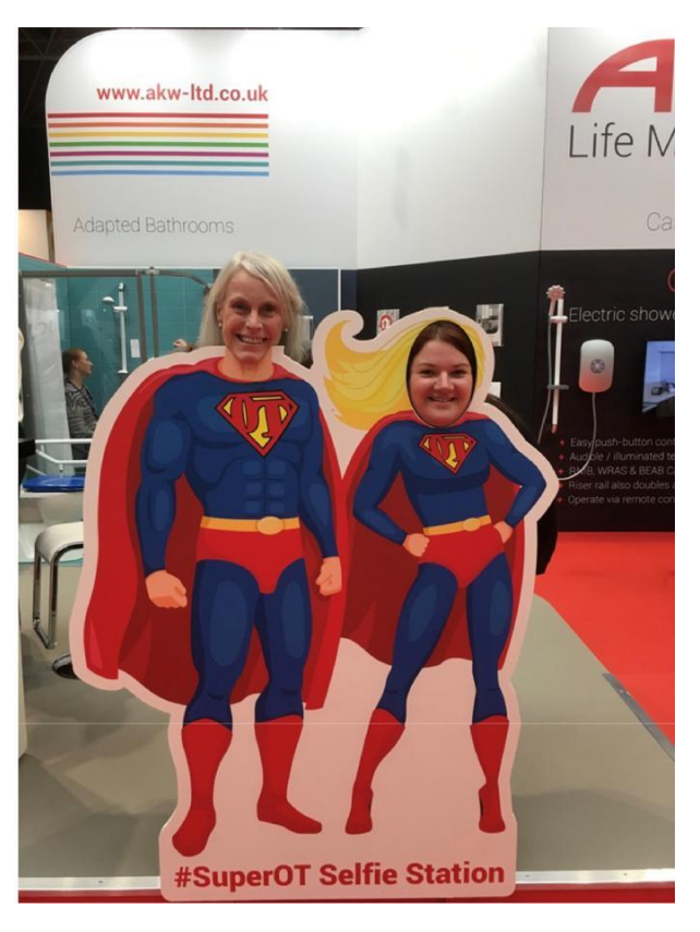
The SuperOT selfie station