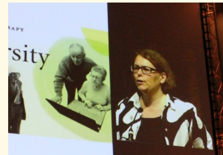
Welcome speech at COTEC 2012 Congress