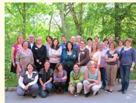
Council meeting May 2012, Stockholm