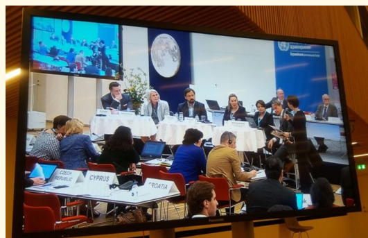
Final Consultation of the European Framework for Action on Integrated Health Services Delivery, 2-3 May 2016, Copenhagen, Denmark (WHO Regional Office for Europe)

During my term we build on everything others started and developed, and focus on three aspects: