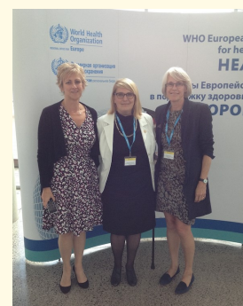
WHO Regional Committee for Europe 65 th session in Vilnius, Lithuania on September 14- 17, 2015