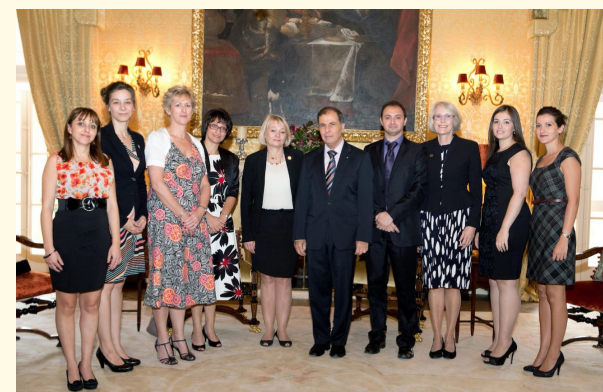
Meeting with Maltese president HE Dr George Abela, Malta 2013,