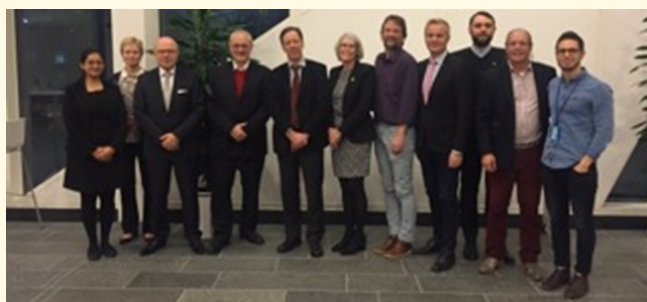
Meeting of Staff groups active in mental health in the European Region. Copenhagen, Denmark

I have been actively involved in COTEC and ENOTHE since 2000 and had the privilege to work with all presidents that contributed to this newsletter and with many, many colleagues from all over Europe. In 2013 I was elected president at the first General assembly in Malta.