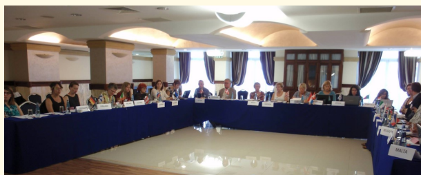
First General Assembly, Malta