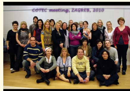
Council meeting Zagreb, March 2010