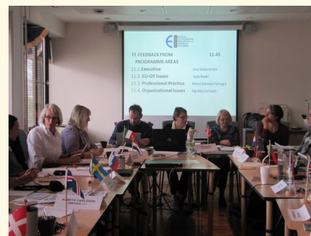
Council meeting September 2010, Helsinki